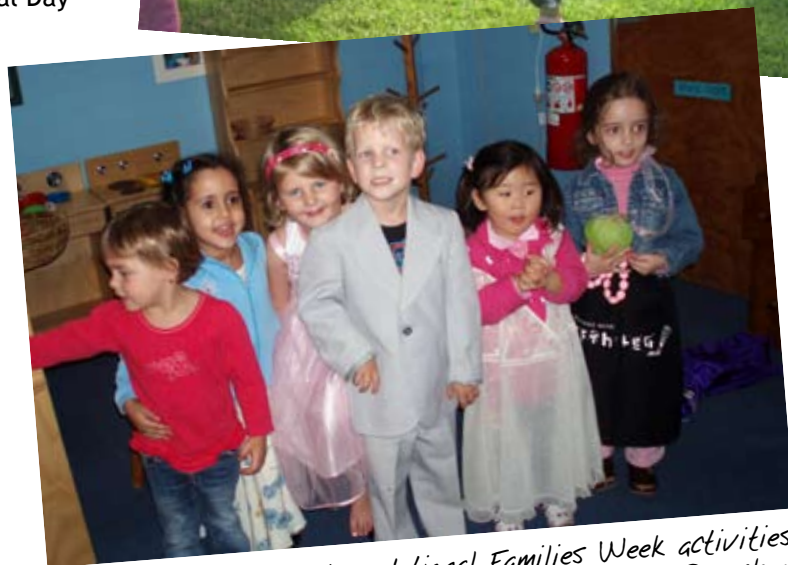
Children enjoying National Families Week activities at Wollongong City Preschool