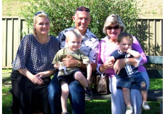
Families enjoying the Father's Day Morning Tea