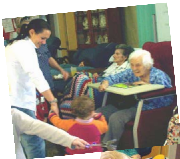
Children from Port Kembla Preschool visit the residents at Mt Warrigal Nursing Home