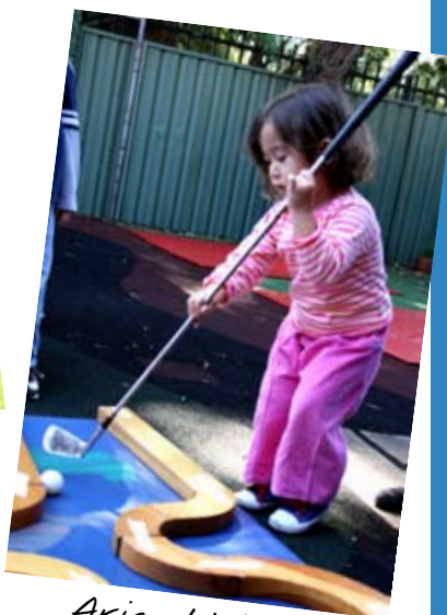
Aria at Wollongong City Preschool putts for gold (below)