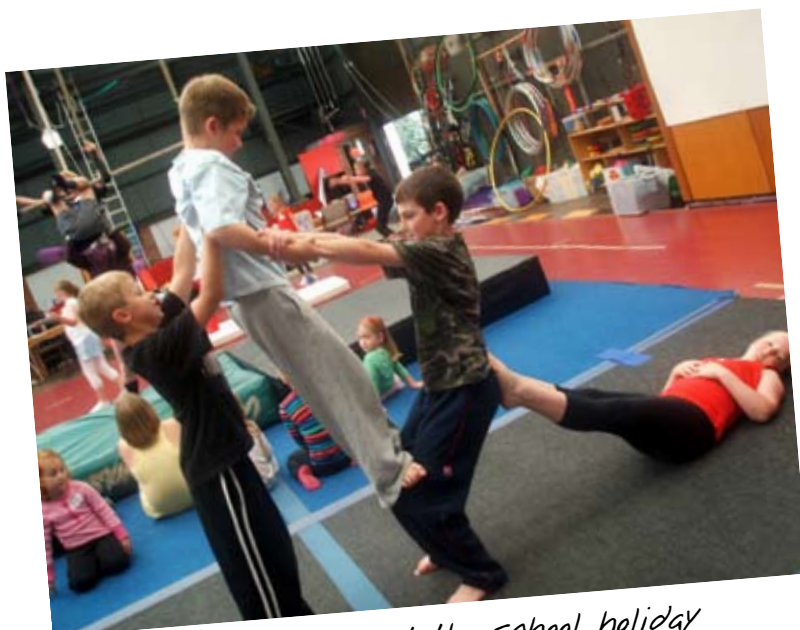
A tower of children at the school holiday circus workshop

Each school holiday period, Illawarra Children's Services runs a special interest workshop for children. Last school holidays it was a circus skills day for children ages 5-12 and the turn-out was phenomenal.